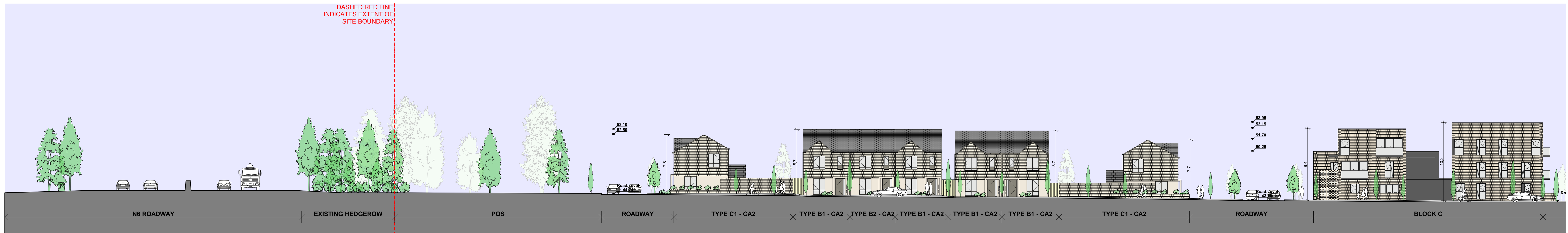
Site Section G-G SCALE 1:200