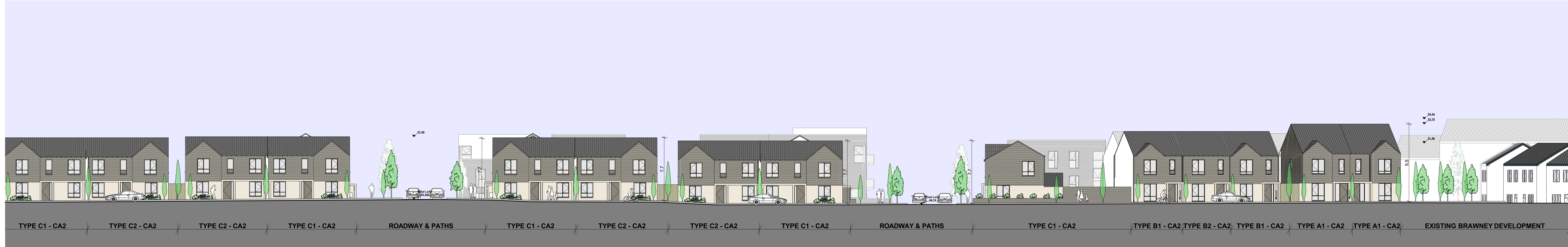
Site Section F-F (Cont) SCALE 1:200