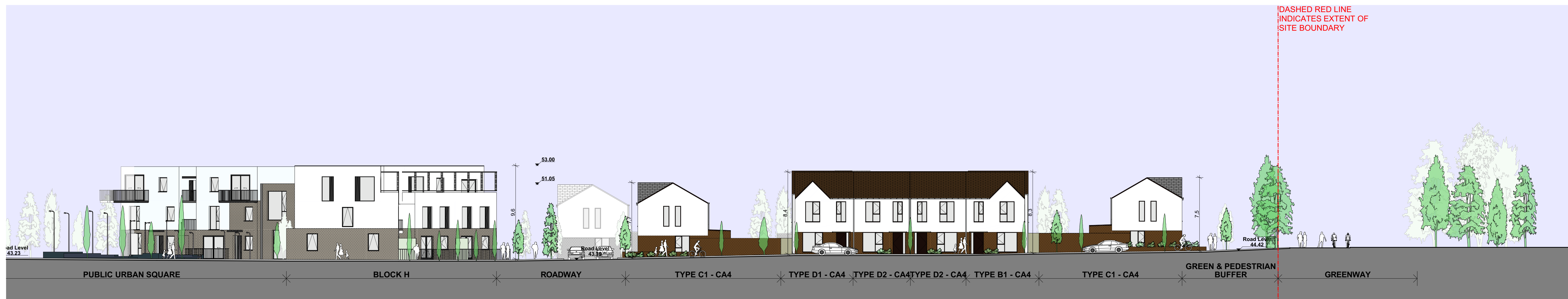
Section G-G (Cont) SCALE 1:200