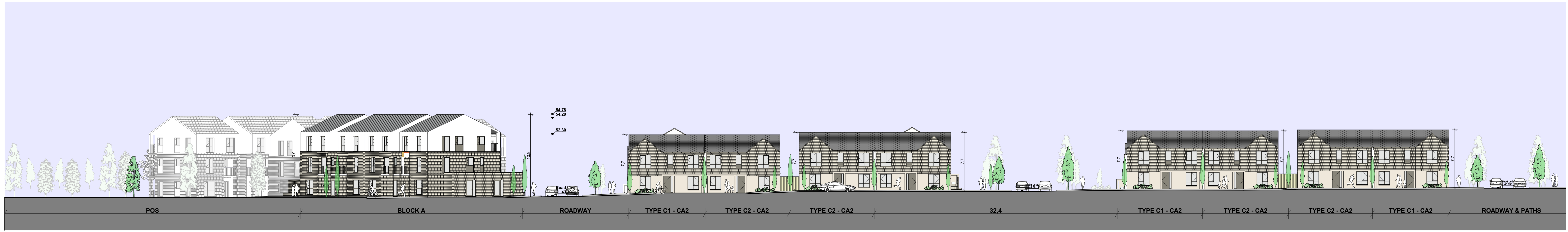
Site Section F-F SCALE 1:200